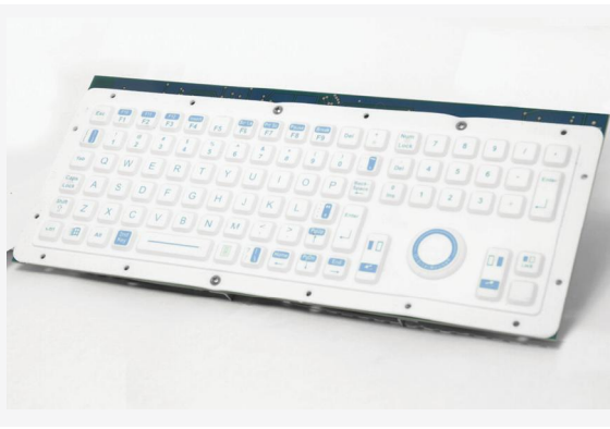
• Shown above KIO78U6 Medical Keyboard with Orbital Mouse®