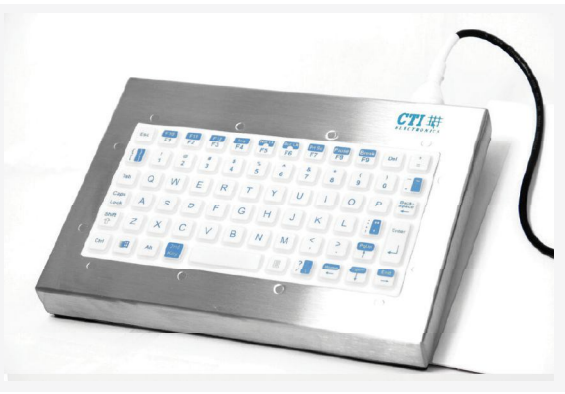
• Shown above KI66U6 Medical Keyboard