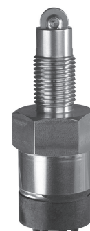
Roller Plunger Actuator Style