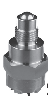
Ball Plunger Actuator Style

The P6-4 series switches are commercial grade limit switches that are watertight and completely sealed to IP68S and IP69K. They are designed to be operated in extreme temperature ranges and with their stainless steel housing, are for use in the most rugged, harsh environments. These switches are available with either a ball or roller plunger actuation method. In addition, these switches can be configured as single pole and double pole plus single throw and double throw. The P6-4 offers three connection methods, solder or screw terminal plus flying wire leads.