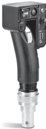
Collective Grip with Thumbwheel Switch and NVG Compatible Backlighting