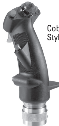
Cobra Style Grips