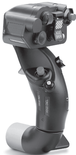
Cyclic Grip with Custom Switch Guards