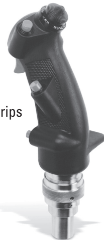
B8 Style Grips