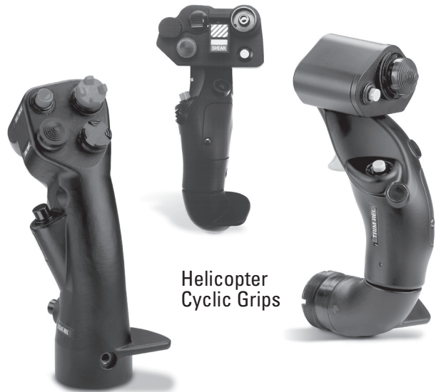
Helicopter Cyclic Grips