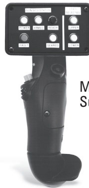
Military Ground Support Grips