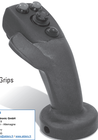
G3 Soft Touch Grips