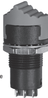
Raised Button Style