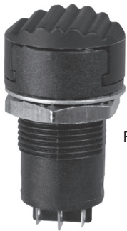
Flush Button Style