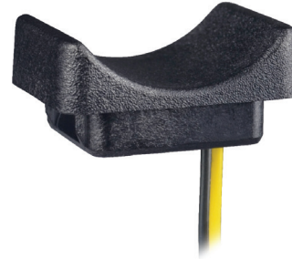
Capacitive Switch Concave Button CS-1