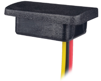
Capacitive Switch Raised Button CS-2